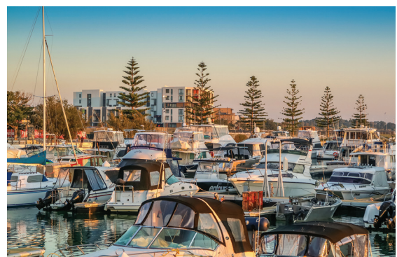
Port Coogee Marina